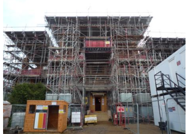
The house with protective roof and scaffolding

It was very kind of Aidan to take the time to give us such an extensive tour and it was very interesting to see the careful and skilful restoration work being carried out which should make sure that Byfleet Manor survives well into the future.