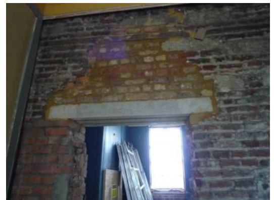
The repaired door lintel and wall