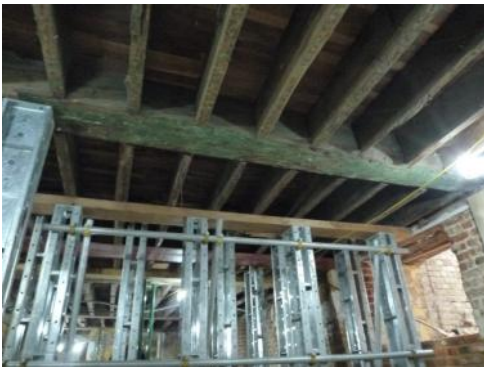
In the basement showing the supports and the large beam believed to have come from a ship

The house is being treated from top to toe. The roof has been mended and all chimneys repointed, and the scaffolding which has covered the house for many months will gradually start to come down. We ventured into the basement which at the moment is full of supporting pillars. It was noticed that some of the timbers were no longer strong enough to support the floors above, but this has now been rectified, and there are a number of measuring points throughout the house to make sure that nothing is moving or settling more than it should. Aidan said that one of the largest floor supports was believed to have come from a ship; others were of varying thicknesses which suggested they had been recycled from another building.